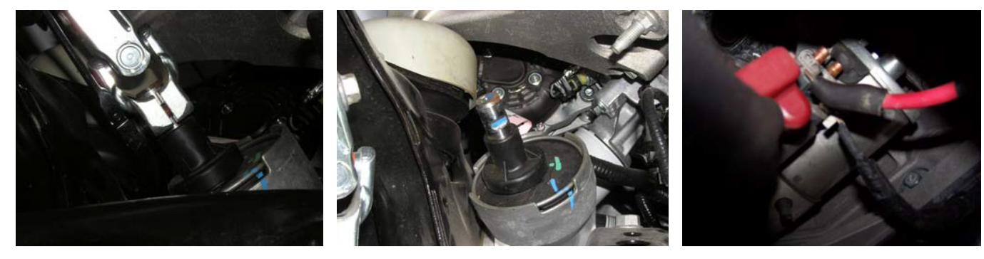
Remove the red plastic cap protecting the starter terminals and disconnect the wiring from the terminals.

· Loosen steering shaft and slide upwards to separate it from it joint.