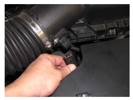
Slide the red retainer clip out on the MAF (Mass Air Flow) sensor and disconnect the harness.

• Remove the engine cover. Not needed on Shelby.