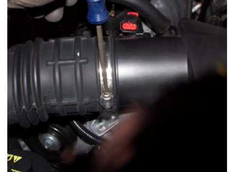
• Loosen the band clamp around the air inlet tube and remove the air cleaner box that is held in by one bolt.