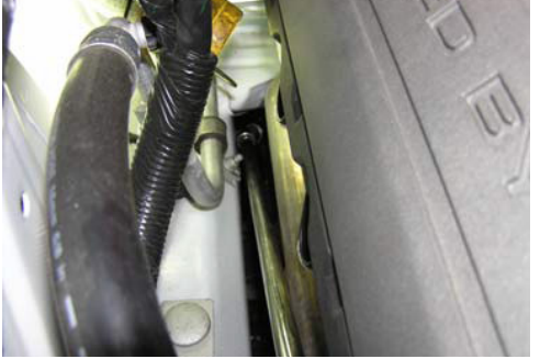
• Remove the outside nuts holding the cats to the manifolds on both sides

• While the vehicle is still on the ground, remove and unplug the front O2 sensors located between the rear of the engine and firewall above the transmission bell housing. Install left and right front O2 sensor extensions at this time.