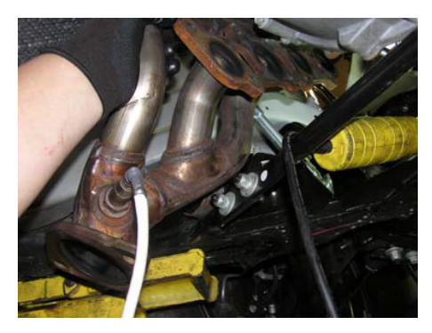
· Remove 02 sensors from manifolds.